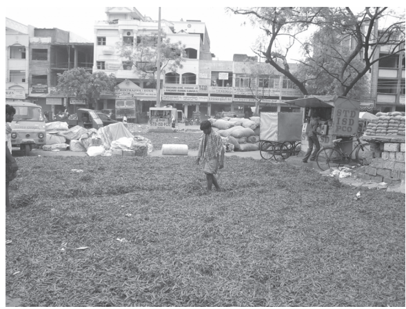
Wading through chilis at Malakpet grain and seed market