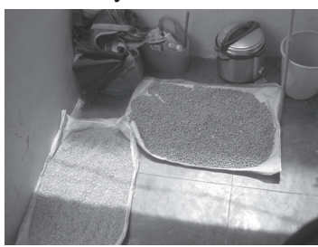
Sundrying of dal and Peanuts in balcony