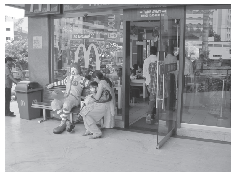
Family having lunch at Mc Donald's, City Center Mall

For further information see http://www.nutrifitindia.com/