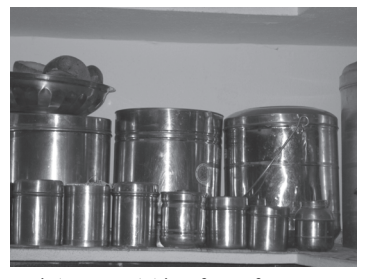
Light-meatal bins for safe storage

Health myths No. 2: Chapatti are healthier than rice Many people nowadays go on diet by eating chapatti instead of rice. Therefore, people assume that they are healthier than the common South Indian staple food. However, the reason behind this is that nutrition counselors usually suggest chapatti instead of rice, because they are easier to count and, therefore, it is easier to restrict yourself. Regarding nutrition it does not make a major difference, especially if you go for brown rice (Nutrifit 2010)