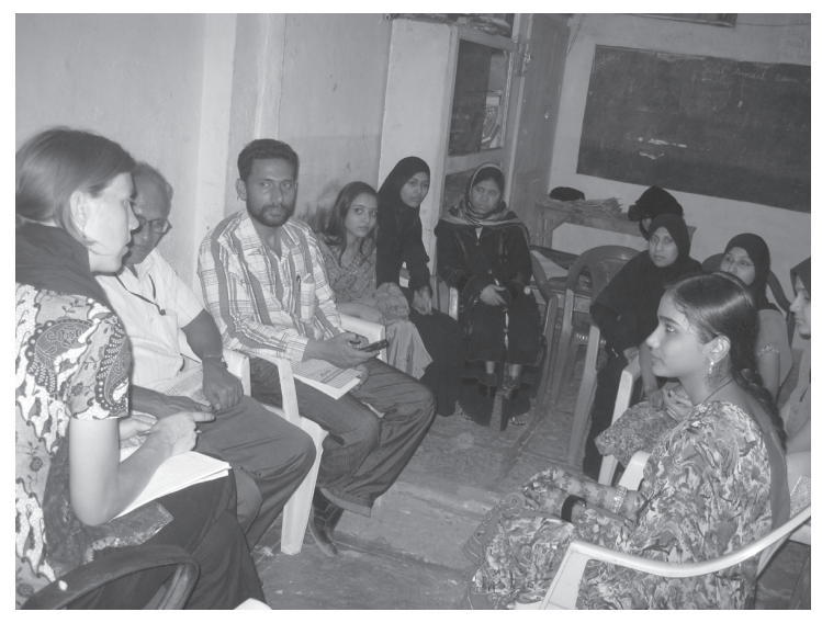
Group discussion at a Ayesha High school in Old City

confronted with several times and give practical information on sustainable consumption such as where to buy organic products, when to buy which fruits and vegetables, where to do shopping in order to be sustainable etc. Inspiration is given, what a sustainable lifestyle could imply (regarding food consumption and shopping behavior) and how it could be shaped in the "Hyderabadi" context. Sustainable ways of living are still practiced among the lower middle classes, but they need to be highlighted as something positive in order to become more prestigious. As major drivers of change the lower middle classes have a huge potential to make a change and take up certain modifications in their lifestyles that can help to improve their health status as well as protect the environment and mitigate climate change at the same time.