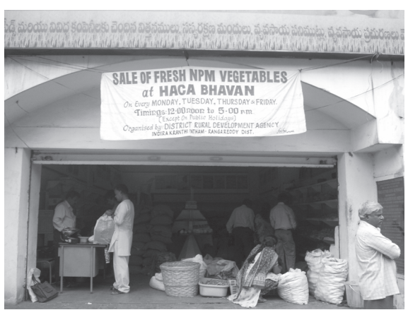
NPM-Vegetables sold at HACA-Bhavan