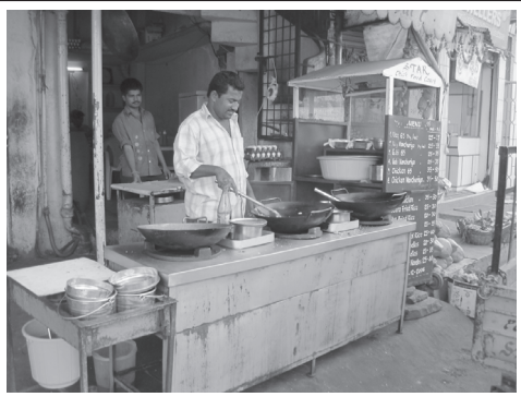
Street vendors selling chinese fast food, Tilak nagar