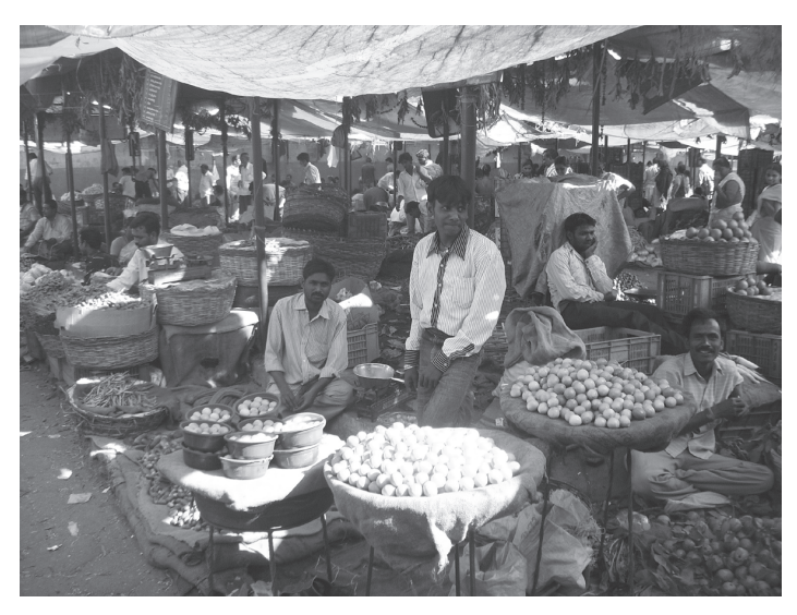
Vegetable vendors, Falaknuma Rythu Bazaar

The period between November and March is the main season to get almost all common vegetables from the surrounding areas (ask for local products). In order to reduce food mileage you can increase the consumption of varieties such as bottle gourd, snake gourd, bitter gourd, red pumpkin and all green leafy vegetables during summer, because they can be found from surrounding areas through the whole year. Most other vegetables (tomatoes, capsicum, eggplant, carrot, etc.) come from Karnataka, Maharashtra and other states during summer and therefore have