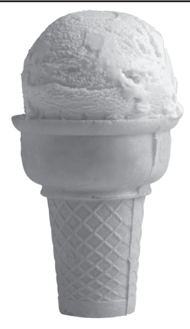
2. Sorghum roti (jowar)

This idea still can be traced back to ayurvedic medicine that distinguishes between "cold" and "hot" foods (on the basis of energy levels) and suggest that one should not have any food items that are having a cooling effect, when having a cold. The ice cream is not the reason for your cold. If you follow ayurveda and have a cold, get some hot lemon with honey in order to provide your body with vitamin C and counterbalance the "cooling" effect of lime with honey.