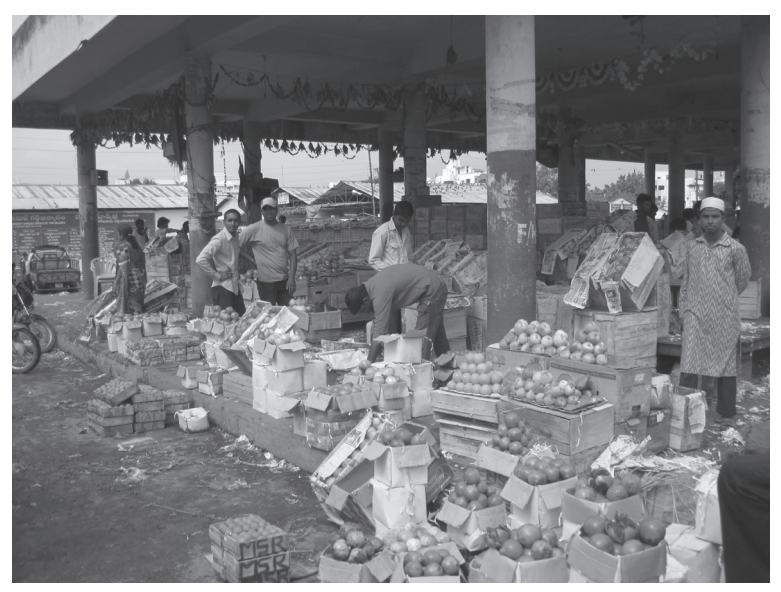
Kothapet fruit wholesale market

http://www.sustainabletable.org/issues/whybuylocal/ http://vegbox-recipes.co.uk/veg-boxes/why-buy-seasonal-food.php